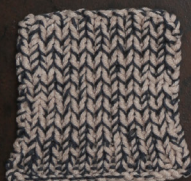
Cosy: Pastel Brown SBF: Dark Grey