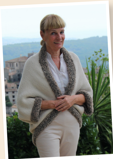
Cosy & Soft Bamboo fine: Off White