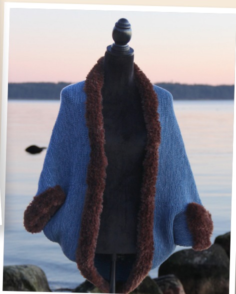
Cosy & Soft Bamboo fine: Jeans Blue