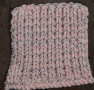
Cosy: Pastel Rose SBF: Light Grey