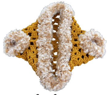
Cosy - Curry Fur Lux - Squirrel

The final size of a shawl jacket is approx. 108 x 108 cm.