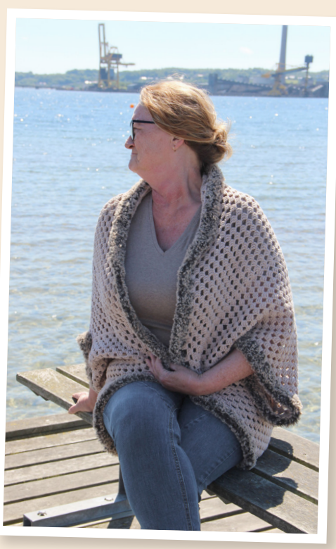
Cosy - Pastel Brown, Fur Lux - Bear