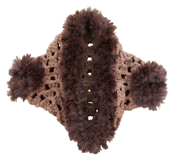
Cosy - Brown Fur Lux - Chocolate