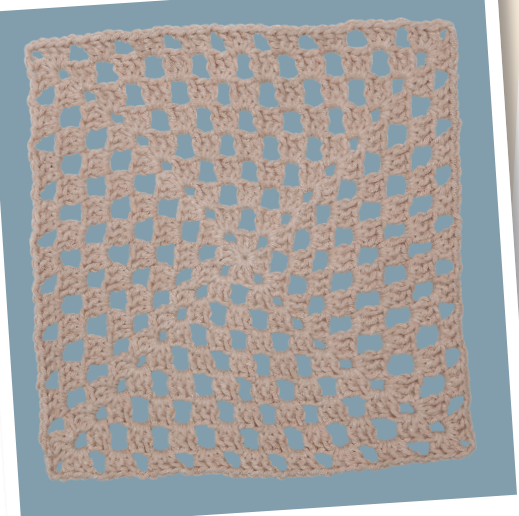
Fully crocheted shawl jacket (in a miniature size).