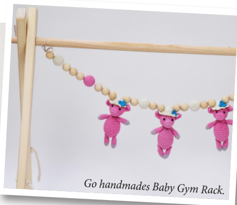
Go handmades Baby Gym Rack.