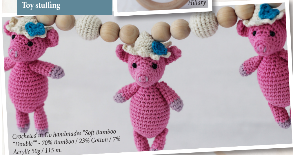
Crocheted in Go handmades "Soft Bamboo "Double"" - 70% Bamboo / 23% Cotton / 7% Acrylic 50g / 115 m.

Go handmade quality design in a unique style