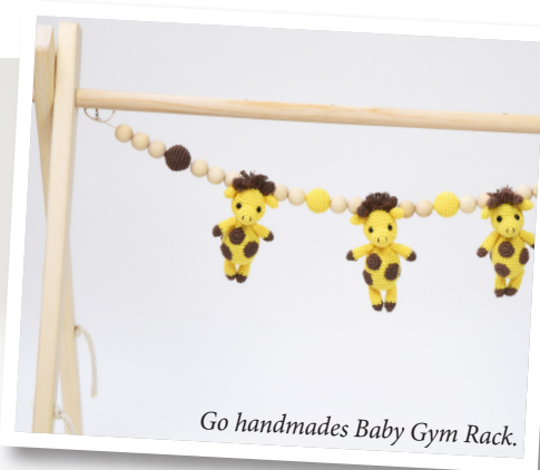
Go handmades Baby Gym Rack.