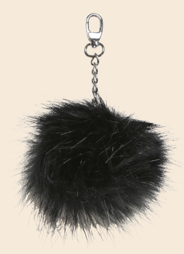
Pom Pom Charm with metal chain - 11 cm