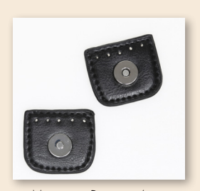
Magnetic Button - 4 cm