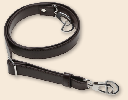
Adjustable shoulder strap - 25 mm x 140 cm