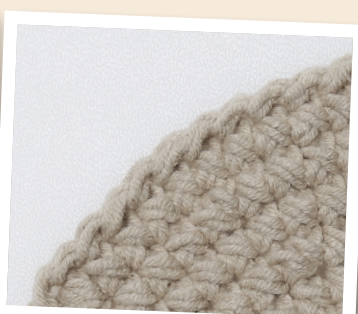
Front side of the dc.