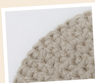
Backside of the dc.

Our backpack is crocheted from a solid bottom, and there is the back of the dc, which becomes our front.