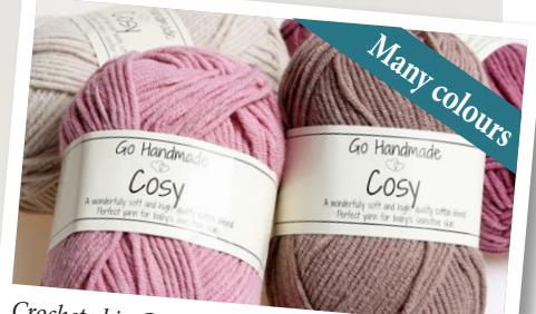
Crocheted in Go handemade's Cosy - a wonderfully soft and high quality cotton mix that keeps the shape. 60% Cotton/40% Acrylic, 50 g/100 m.