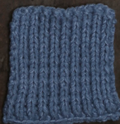
Cosy: Jeans Blue SBF: Jeans Blue