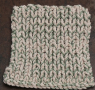
Cosy: Pastel Brown SBF: Soft Green