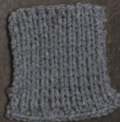
Cosy: Grey SBF: Grey