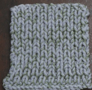
Cosy: Sky Blue SBF: Soft Green