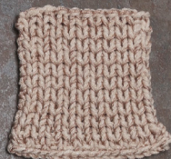
Cosy: Pastel Brown SBF: Nude Beige