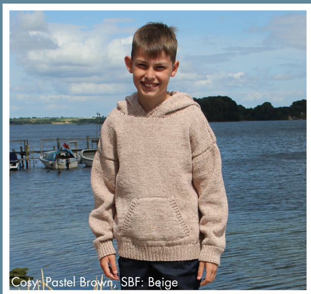
Cosy: Pastel Brown, SBF: Beige

Therefore, we will recommend a range of needle sizes.