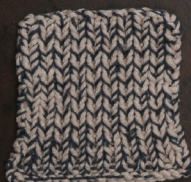
Cosy: Pastel Brown SBF: Dark Grey