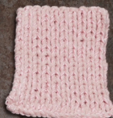
Cosy: Pastel Rose SBF: Light Pink