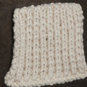
Cosy: Off White SBF: Off White