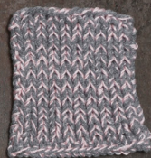
Cosy: Grey SBF: Light Pink