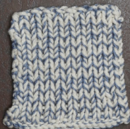
Cosy: Off White SBF: Jeans Blue