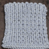
Cosy: Sky blue SBF: Light Grey