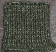
Cosy: Hunting Green SBF: Soft Green