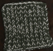
Cosy: Hunting Green SBF: Off White