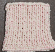
Cosy: Off White SBF: Light Pink